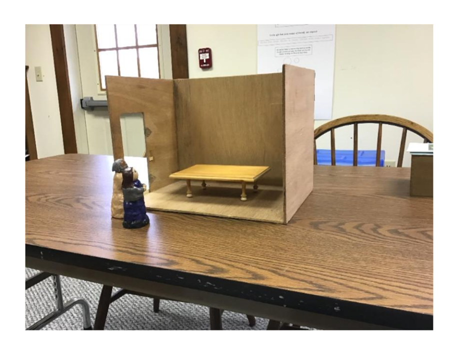
So, they went and found everything as he had told them;