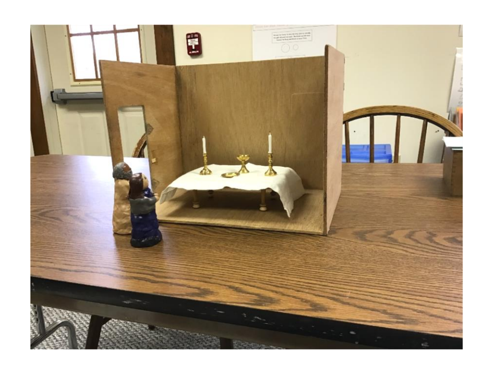
and they prepared the Passover meal.