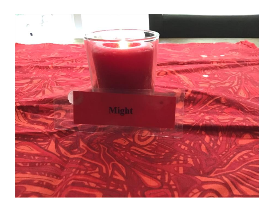
Might: To be strong for God, to not give up.